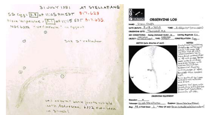
(L) <u>Veil Nebula East</u>, with 3-inch f/10 reflector at 30X (R) <u>Veil Nebula West</u>, as seen with 10-inch f/5 reflector at 48X. Sketches by Glenn Chaple

More recently, I viewed the Veil from my backyard in suburban north-central Massachusetts (limiting magnitude 5.5). It was barely visible with a 4½-inch f/8 reflector and still faint through a 10-inch f/5 reflector. Both scopes needed an assist from an O-III filter and (even better) an Orion UltraBlock narrowband filter. Editor: To see an enlarged image of Glenn's drawings click on the following links: Veil Nebula East or the Veil Nebula west.