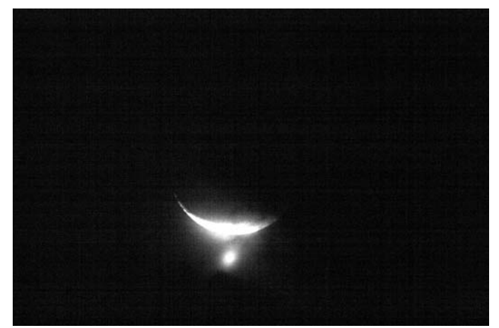
Venus occulted by the Moon.