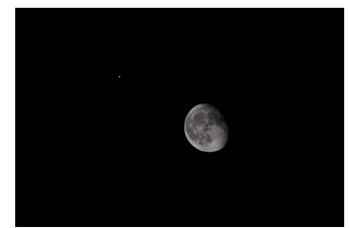
Mars and the Moon.

The following image was taken on Saturday, September 5th showing Mars approximately one degree away from the Moon.