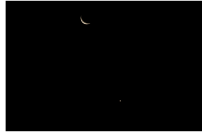
Venus and the Moon.

I awoke in the early hours of Saturday, August 15th to image Venus passing 4 degrees away from the Moon. A <u>high resolution</u> <u>image</u> can be seen in the ATMoB Gallery.