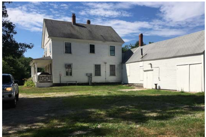
The Clubhouse.