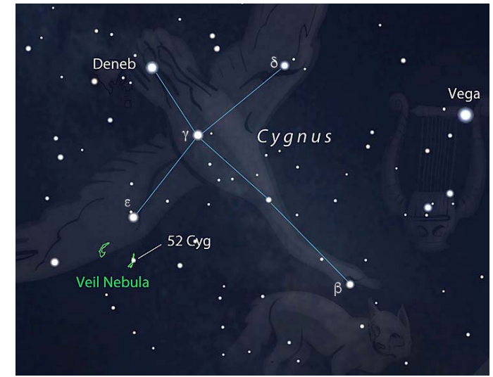
Finder Chart for the Veil Nebula, Stellarium and Sky & Telescope

The Cygnus Loop is a supernova remnant, the result of a supermassive star that suffered an explosive death some 5,000 to 10,000 years ago. Recent GAIA parallax measurements of stars imbedded in the Cygnus Loop gases indicate a distance of 2400 light years, suggesting a true diameter of 130 light years.