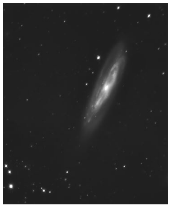
M98 (NGC 4192).

May 2017 Courtesy LVAS Observer's Challenge*** M98 (NGC 4192) – Galaxy in Coma Berenices Mags. 12.1/12.2 Mag. 10.1; Size 9.8' X 2.8'