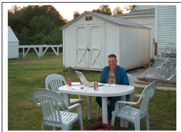
New President - Hard at work at our new outdoor conference table