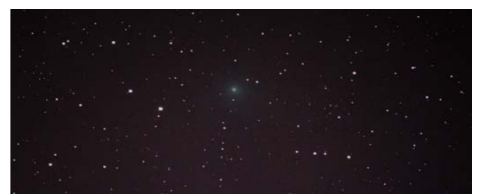
Comet 144P/Kushida – 19 images, 32 sec. subs, Tak. E180, Al. T.)

mask. Continuous groups of folks kept Steve busy until 1 am. Items observed included planetaries, double stars, galaxies and one comet. M76 in Perseus was a favorite; poor seeing rendered two planetaries in Cygnus less than spectacular. M-42, M-31, M-32 & M-110 were requested for viewing. The triple star in Eridanus with a yellow sun like star and two dwarfs, one blue and one red was a hit; as was the Easter Egg double in Perseus. The numbers had dwindled when Comet 144P/ KUSHIDA was found in Taurus at mag 10.8. This was at the limit of detection for the wind swept skies. The other two comets were not recovered.