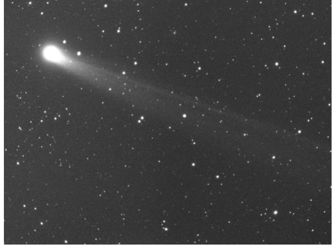
C/2013 R1, Comet Lovejoy. 30 Nov 2013.*

January Star Fields <u>DEADLINE</u> Sunday, Dec. 22<sup>th</sup>