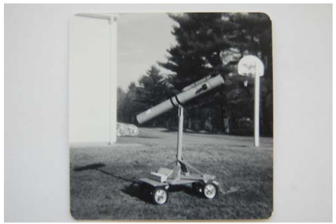
First Telescope.

Christmas; the Holidays; giving and receiving. That's what it's all about! Isn't it?? Well for a youngster, having been brought up in the tradition of giving and receiving (with my own emphasis on receiving), that was the context in which was born the idea that it was the ideal time for me to ask for a telescope! I'd been thinking about this for some time while perusing my Sky and Telescopes given to me by one of my early mentors. The likes of Unitron, Questar, Astrola were gleaming in my eyes; what I wouldn't do for one of those works of art and science . . . Ah, but reality does not escape a fourteen year old. No way were my parents going to spring for one of those. There was just no way.