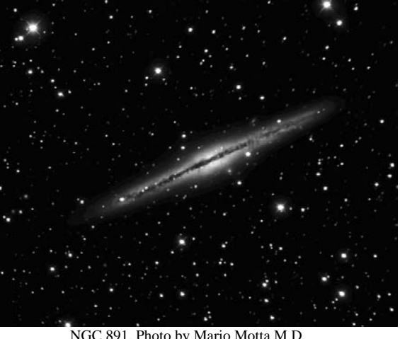
NGC 891.

Last month, we turned our attention to the spiral galaxy NGC 7331 to get an idea what the Andromeda Galaxy (which is similar in size and structure) might look like were it 20 times