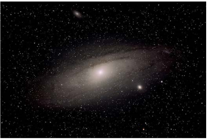
M31, Andromeda Galaxy