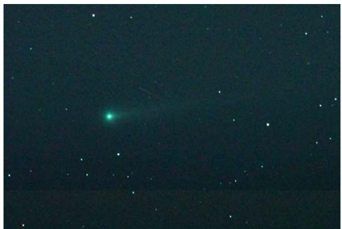
C/2012 S1, Comet ISON, 05:17 EST, 9Nov.2013.*

Comet C/2012 S1 (ISON) has been a real disappointment so far. This future sun grazer is a magnitude dimmer than predicted. It is currently a binocular object and many people have reported seeing the coma and a dim tail. The comet is presently in Virgo and will reach perihelion on November 28<sup>th</sup>.