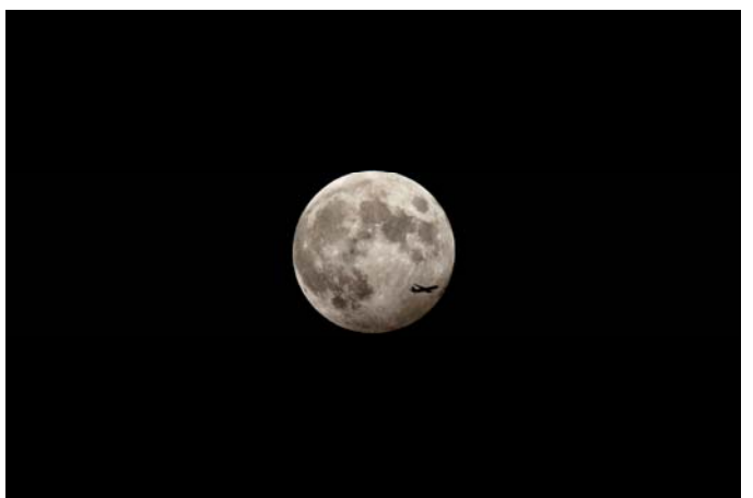
Penumbral Lunar Eclipse and aircraft transit. *

While setting up for the first image, a plane transited across the face of the Moon and I snapped a single image as it passed over the eclipsed region.