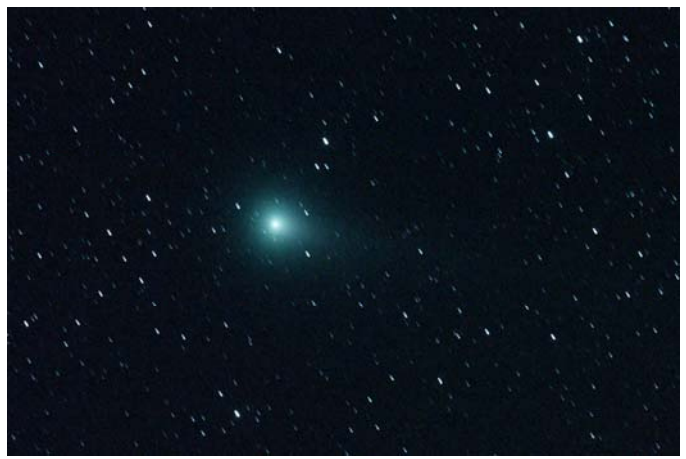
C/2013 R1, Comet Lovejoy. 9Nov2013.*

comet is easy to view with a pair of 50mm binoculars and it will soon reach naked eye visibility in the latter part of November.