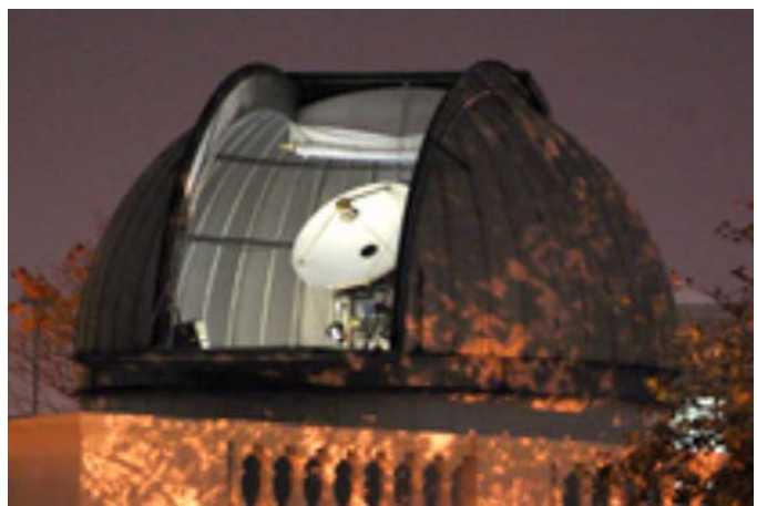
1.2-meter Millimeter-Wave Telescope.

Parking at the CfA is allowed for the duration of the meeting