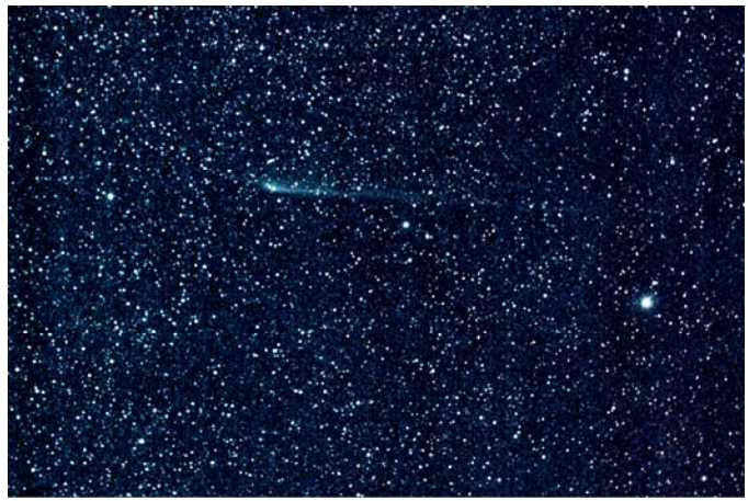
Comet C/2011 L4 (PANSTARRS) and Polaris.