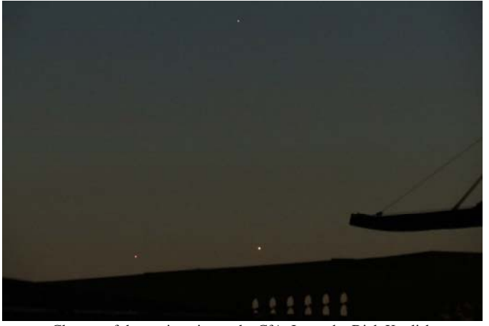
Closeup of the conjunction at the CfA.