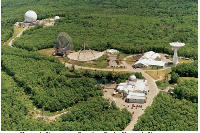
Haystack Observatory Complex.

Parking at the CfA is allowed for the duration of the meeting