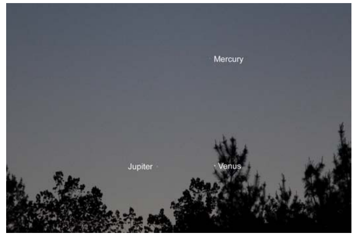
Conjunction from the ATMoB Clubhouse.

On May 27th, Mercury, Venus and Jupiter formed a triple conjunction at sunset. The following images are from that evening.