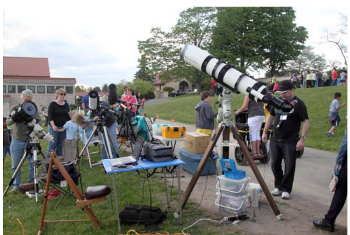
ATMoB telescopes set up at the Clay Center.

The ninth-annual Astronomy Day held on Saturday, May 18, was the biggest and best ever, with over 2,500 attendees, and 120 volunteers and exhibitors. The Clay Center thanks all members of ATMoB who showed up in force for the event. The crowd was treated to a beautiful day that allowed for solar viewing during the day and visibility of Saturn and the Moon at night.