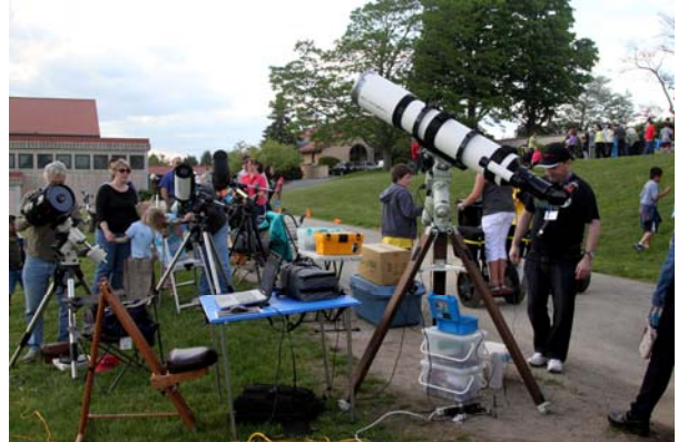
Clay Center Astronomy Day Scopes *