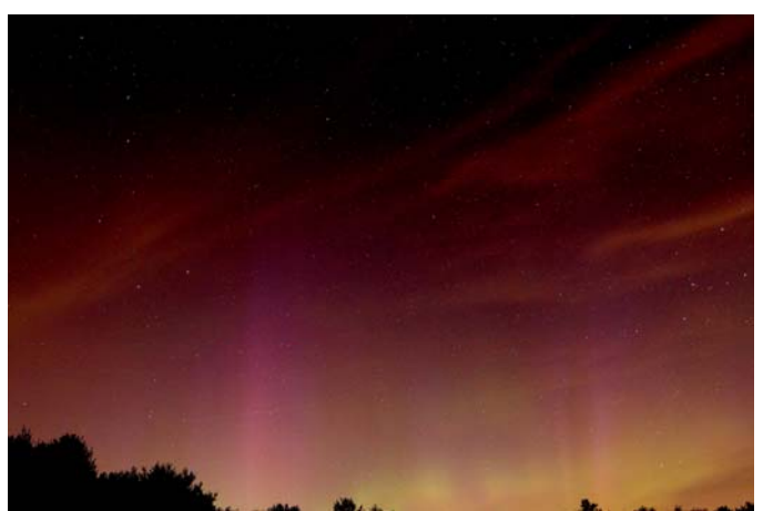
Aurora Borealis. June 23, 2015, Harvard, MA.

Sunspot, Active Region AR2371, produced an M2 class flare and sent a coronal mass ejection toward the Earth on June 21st. On the evening of June 22rd, the Kp index fluctuated between 7-8 and produced an auroral display that was seen visually. Faint whitish "curtains" could be detected and occasionally, dim reddish areas would appear on the northern horizon between the Big Dipper and Cassiopeia.